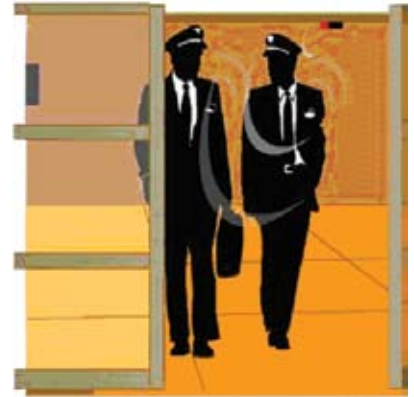
RFID implemented process at the Airport entrance

The process starts when personnel enter the entrance of the airport. All employees are given RFID enabled