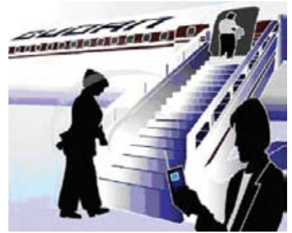
RFID implemented passenger-boarding process

At the time of boarding the aircraft, the passenger is validated once again on entry to ensure that he/she is boarding the right flight and no unauthorized personnel or baggage is boarding the plane with the help of the RFID hand-held reader. The "passenger-on-board" message is immediately sent to the system. In case of any discrepancy or passengers not checked in alarms are generated and the system starts sending SMS to the passengers that the boarding gate will close in x minutes. The system will also notify the airline personal, as to the last checkpoint the passenger