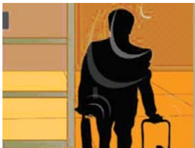
RFID enabled exit system at the Airport

monitoring and control facilities to ensure that no unauthorized access is possible in high security areas, and personnel have to pass through multiple biometric access points to gain access to those areas. The system can also provide the real-time location of individual passengers, analyze traffic and the behavior of individuals, and observe and record unusual behavior and notify the concerned personnel to take appropriate action.