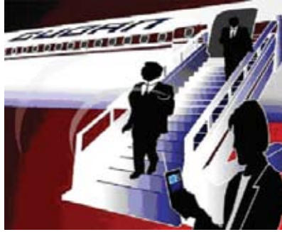
RFID enabled disembarking process