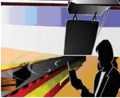
RFID enabled baggage-loading process