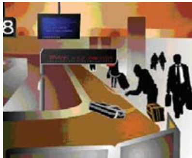
RFID enabled baggage collection process