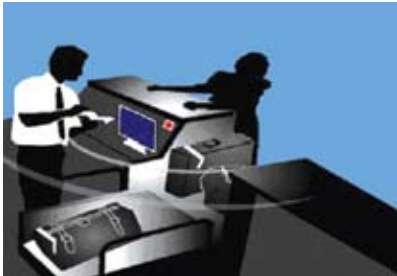
RFID-based boarding pass generation